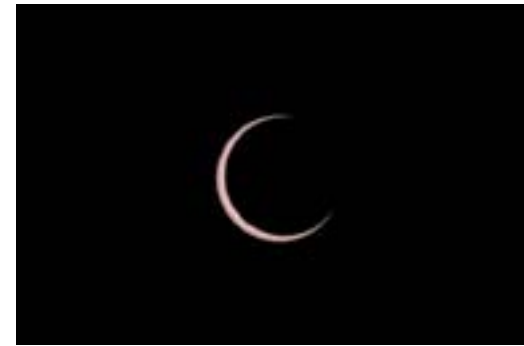
The 2012 annular eclipse will look a little like this from San Jose. Although almost 90% of the sun will be covered, the remaining portion of the sun is not filtered out and staring at the sun will cause eye damage. Use glasses that are intended for solar viewing. This image was taken during the 2005 annular eclipse. It was captured in Portugal by Paula Santos and rotated 180 degrees by the editor. The picture was taken with a Nikon D70 and a 400 mm lens (compares to 600 mm with 35 mm film). Exposure was 1/250th of a second. License for this image is via the Creative Commons Attribution License and found on Wikimedia Commons.

So probably just unusual morning clouds — but it's pretty cool that something like that could be discovered by an amateur.