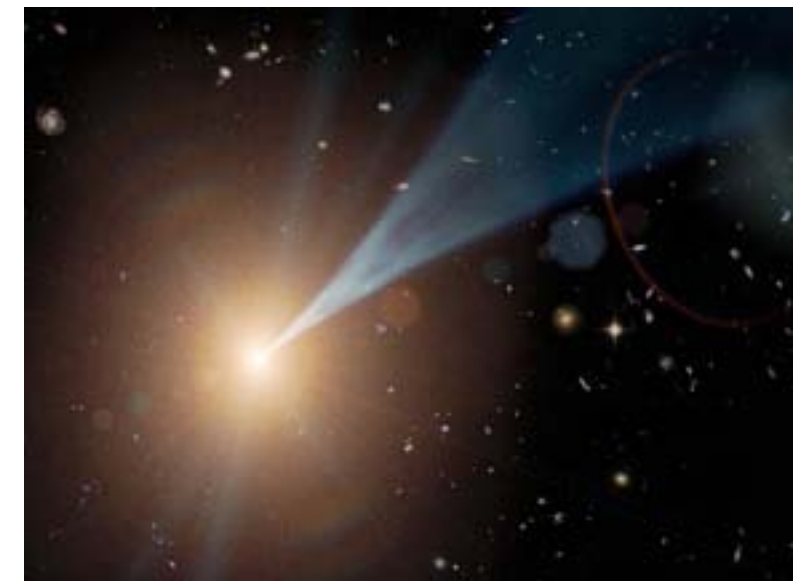
This image is an artist's conception of a blazar. These are typically found at the core of galaxies. They emit light throughout the EMR spectrum but very heavy in gamma-rays. The energy from the gamma-rays accelerates particles to near light speed and these accelerated particles emit infrared radiation.

New information indicates that blazars may be much more numerous than previously thought. NASA's Wide-field Infrared Survey Explorer has found 200 blazars and more discoveries are likely. "Blazars are extremely rare because it's not too often that a supermassive black hole's jet happens to point toward Earth" said Francesco Massaro of the Kavli Institute for Particle Astrophysics and Cosmology near Palo Alto. "We came up with a crazy idea to use WISE's infrared observations, which are typically associated with lower-energy phenomena, to spot high-energy blazars, and it worked better than we hoped." This research should yield insights into the evolution of super massive black holes. NASA's Fermi mission has identified hundreds of gamma ray sources and many are suspected blazars. WISE data so far indicates that just over half of the gamma ray sources are indeed blazars. "WISE's infrared vision is actually helping us understand what's happening in the gamma-ray sky" according to Raffaele D'Abrusco, a co-author of the papers describing the blazar detections.