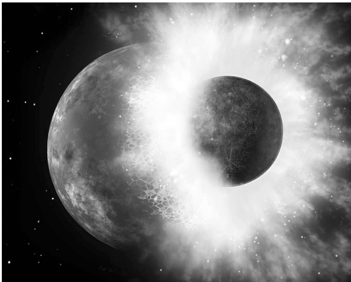
Artist's rendering of cosmic collision involving two objects whose combined mass was at least twice that of our Moon. Discovered using the Spitzer Space Telescope in the planetary system of a star called HD 172555 100 light-years away.

See Spitzer Space Telescope's brand new Web site at http://spitzer.caltech .