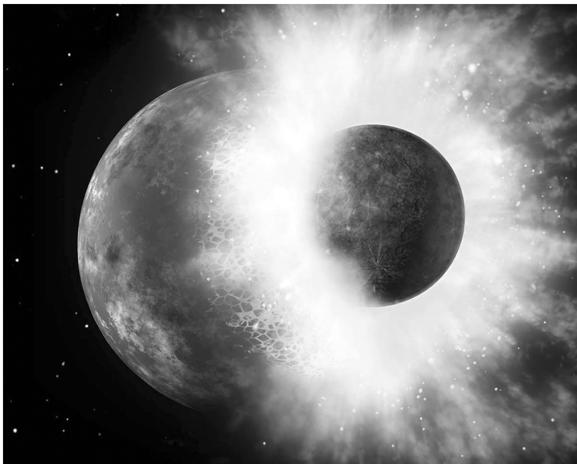
Artist's rendering of cosmic collision involving two objects whose combined mass was at least twice that of our Moon. Discovered using the Spitzer Space Telescope in the planetary system of a star called HD 172555 100 light-years away.

See Spitzer Space Telescope's brand new Web site at http://spitzer.caltech .