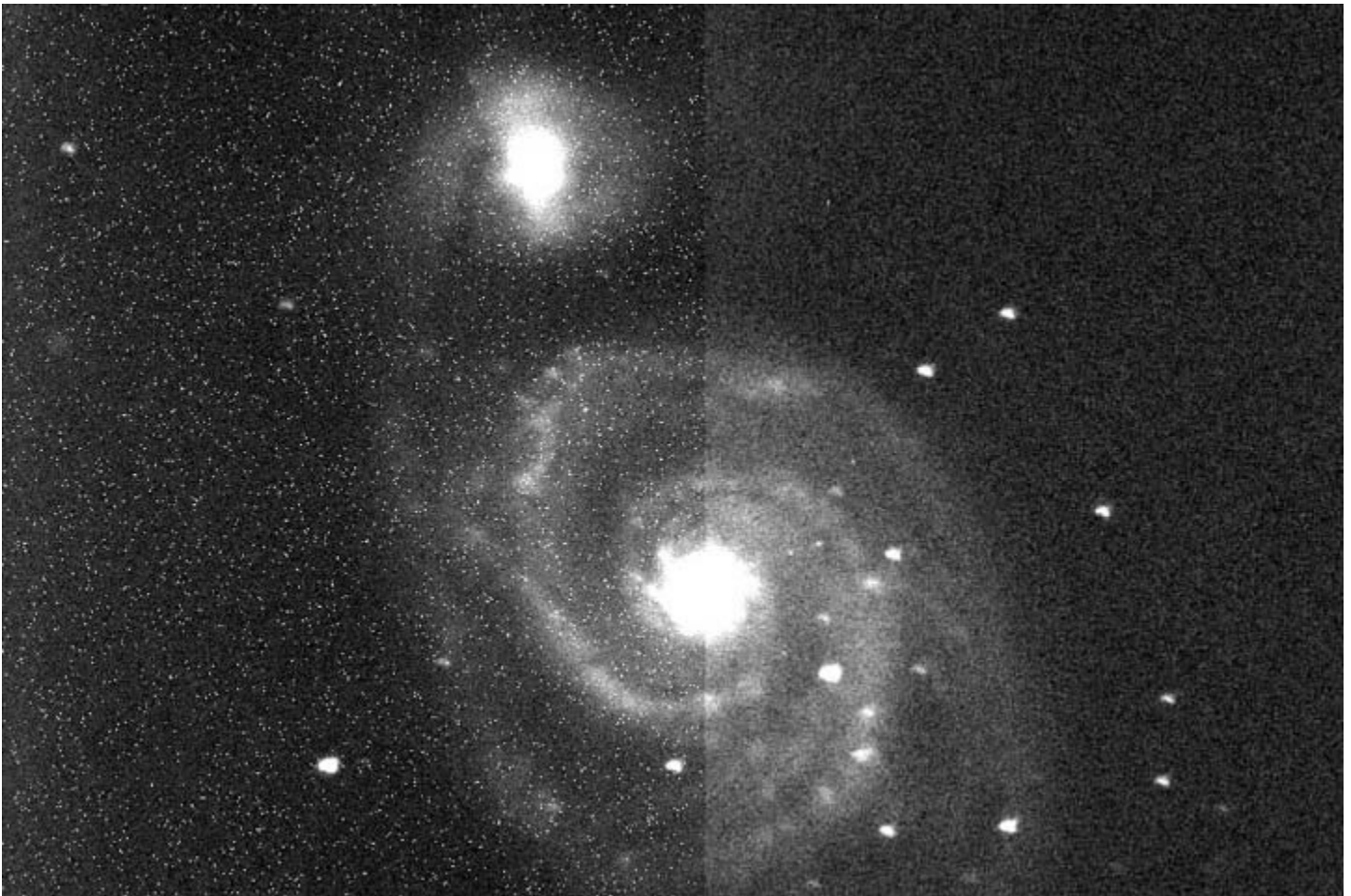
This image is a 90-second exposure of M51 taken May 16, 2009. The telescope is a Meade LX 200 Classic and the imager is an SBIG ST-7XE. The left half of the picture shows the image before using the "dark" exposure to subtract the noise. The camera was cooled to -5 Celsius. While this picture isn't going to put the Hubble Space Telescope out of business, I think it is interesting to note a few things visible here. First, M51's companion, NGC 5195, has a bar structure that might be near vertical in this orientation. M51 has two arms but just above the galactic core one of the arms is partially bifurcated. To the left and the right of the core, between the two arms, are some structures that are sometimes called "feathers" which are actually associated with star forming regions. The foreground stars are not crisp, point-like objects which is caused by inaccuracies in the telescope's tracking. Stacking multiple images might improve the quality of the final image.

MAY-14-2009 Herschel and Planck successfully launched http://jpl.nasa.gov/news/news.cfm?release=2009-085