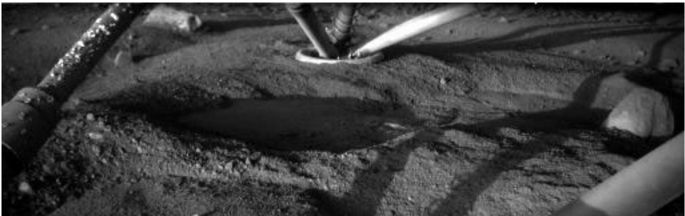
This photo from September 1, 2008 shows clumps that have accumulated on one of the landing struts (upper left of picture). The flat spot of ground near the center of the picture is called "Holy Cow" based on scientists first reaction when they saw it.

AUG-14-2008 New details from Enceladus Cassini's August flyby of Enceladus is allowing scientists to pinpoint the location of the ice geysers from that Saturnian moon. Cassini imaging team leader Carolyn Porco said "This is the mother lode for us. A place that may ultimately reveal just exactly what kind of environment - habitable or not - we have within this tortured little moon." The flyby sent Cassini zooming past Enceladus at 40,000 miles per hour. How do you keep your focus on one part of the moon while doing that? You don't. Instead, a technique called "skeet shooting" was used where the spacecraft is spun as fast as possible to try to match movement of the target. http://jpl.nasa.gov/news/news.cfm?release=2008-160