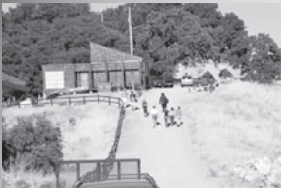
Fremont Peak Observatory