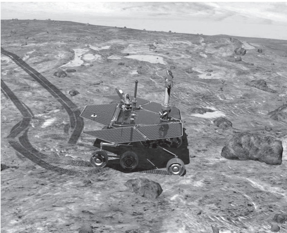
Are these rocks of any scientific interest? With the new AEGIS software, the Mars Rovers, Spirit and Opportunity, will be able to judge for themselves whether a scene is worth a high-resolution image. (Artist's rendering.)

Check out other ways that the Mars Rovers have been upgraded with artificial intelligence software at http://nmp/TECHNOLOGY/infusion.html#sciencecraft .