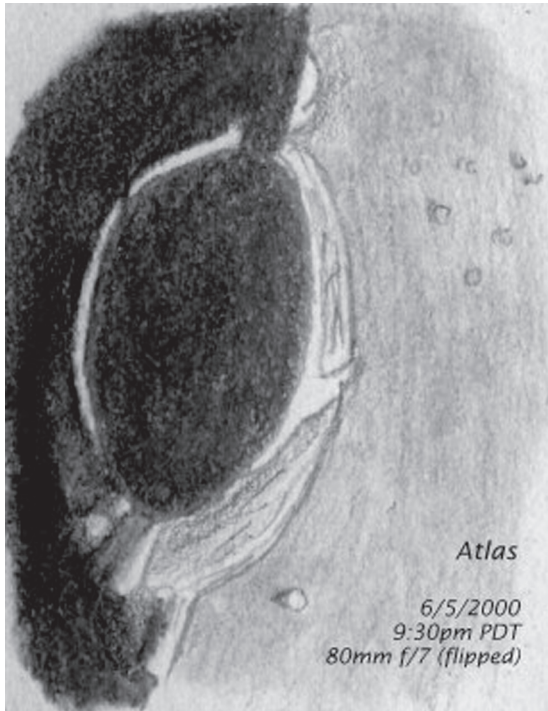
The lunar crater Atlas, sketched by the author.

Of course, you're not going to see those amazing color details in faint galaxies