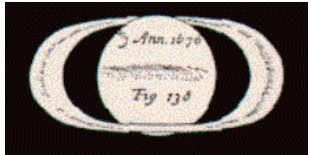
In 1676 Giovanni Cassini made this sketch showing the shapes of two rings with a dark band between them. We now know this as the Cassini gap.

In addition, the eye can react faster than a camera. When you're observing bright shallow sky objects, you can catch those instants of good seeing that in a photo would get averaged with the bad moments on either side. Modern CCD astrophotographers compensate