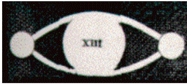
A drawing made by Christiaan Huygens in 1655.

and nebulae which are so beautiful in photographs. A camera is the only way to collect that.