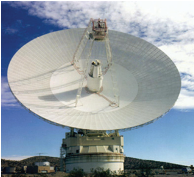
For over 40 years, the “Mars” 70-m Deep Space Network antenna at Goldstone, California, has vigilantly listened for tiny signals from spacecraft that are billions of miles away.

This article was provided by the Jet Propulsion Laboratory, California Institute of Technology, under a contract with the National Aeronautics and Space Administration.