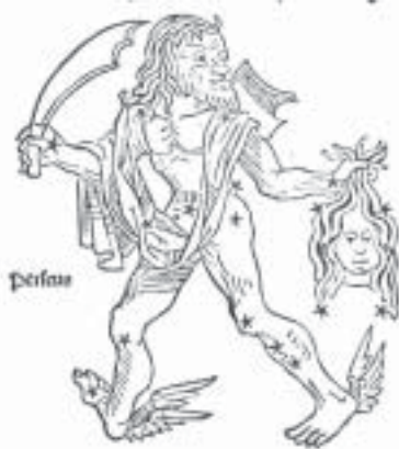
Perseus from Poeticon astronomicon. Venice, 1482. The woodcut reproduced here is that of Perseus, holding the newly-severed head of the Gorgon. In the Renaissance the work was usually attributed to the Roman historian C. Julius Hyginus, who lived in the first century B.C., but we now know it was probably composed by some other Hyginus at a later date. The order of the constellations follows that of the catalog in Ptolemy's Almagest, so the work may date from the second century A.D or later.