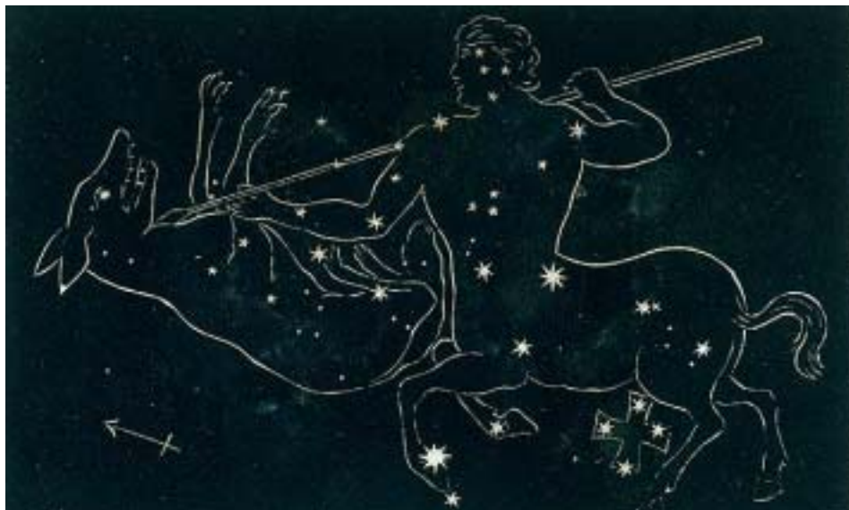
Centaurus and Lupus , by Christoph Semler, Coelum stellatum . Magdeburg, 1731. Semler is another one of those celestial cartographers who is unknown except through his atlas. The Semler atlas is immediately distinguishable from all its predecessors by the black background on the plates. Each plate was printed from a woodblock, cut only to outline the constellations and pinpoint the stars. Each of the 35 woodcuts has a different orientation, which can sometimes be disconcerting, although celestial north is indicated by an arrow on each plate. Some of the illustrations are quite attractive, such as the one that depicts Centaurus, standing over the Southern Cross, engaging Lupus the Wolf.

If you know of other interesting books or Internet sites covering this